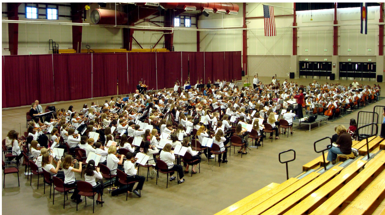
Two hundred and eighty eight musicians at the Silver Anniversary performance in Douglas County