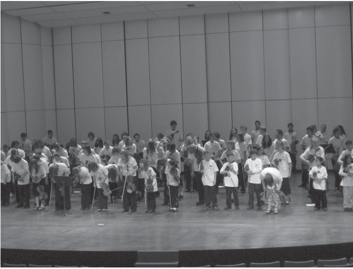
Viva Viola Day 2007