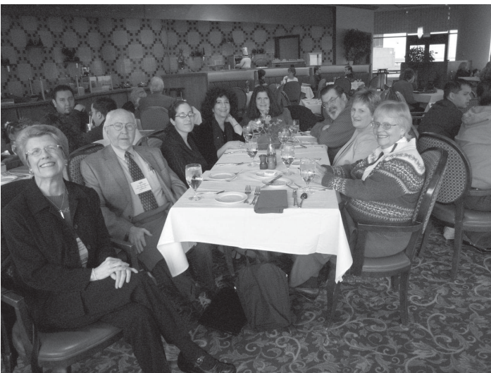
CASTA, Inc. members enjoying their time at the ASTA National Conference in Detroit